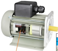
Embedded drive of BLDC motor